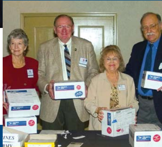
Members of the Sarasota (Fla.) Chapter send comfort care items to deployed servicemembers as part of their Support Our Troops program.

No one represents you better on Capitol Hill than MOAA. Chapter members provide grassroots support needed to pass legislation that protects and enhances your benefits.