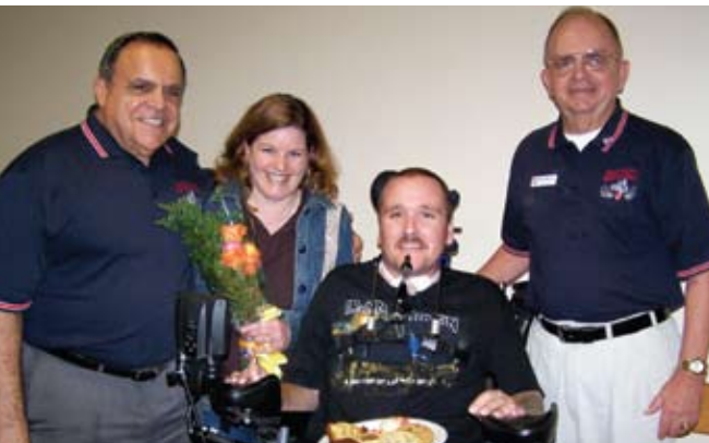
Members of the Tampa (Fla.) Chapter have helped hundreds of wounded servicemembers and their families through their award-winning program, Operation Helping Hand.

Is chapter membership for you? If you're still not sure, check out a local chapter meeting yourself.