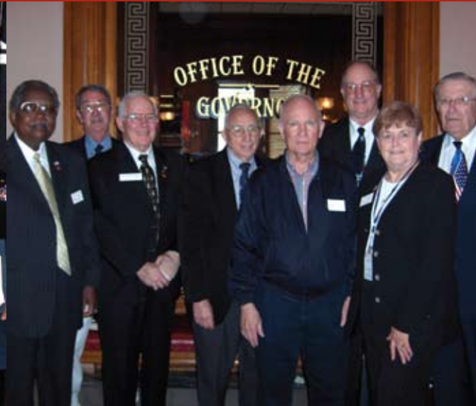
Chapter members in Georgia lobby for state legislation that will benefit military members and their families.